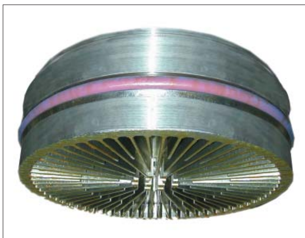
High melt rate capacity drum